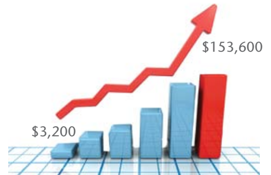
POTENTIAL MONTHLY SALES OVERRIDES

Only Consultants enjoy a $400 - $800 residual income on the sales of their Associate pool. Your organization builds fast!