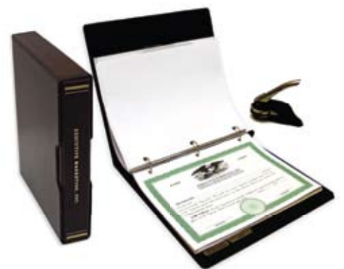
YOUR OWN CORPORATION

"I can't say enough about how much I like your program. It is easy to understand!"