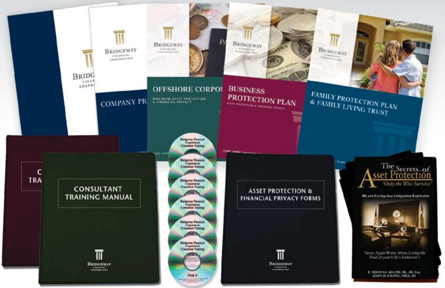
A COMPLETE PACKAGE OF SALES MATERIALS